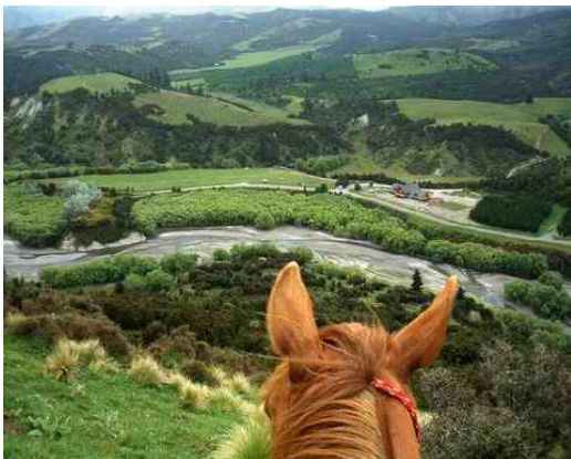
Horse treks, centre, Mt Lyford Lodge, right

Treat yourself to an unforgettable experience and come riding with us at Mt Lyford over breath taking scenic alpine trails, and learn how to partner up with your horse.